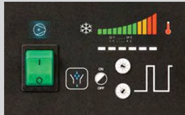
Controls: Models 200-400 scfm