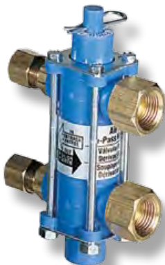
Air Bypass Valve