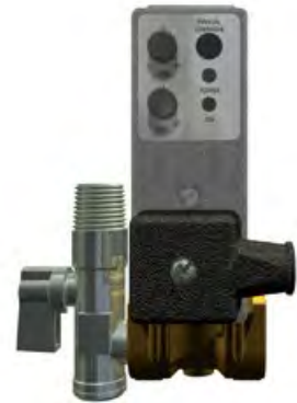
Adjustable Timed Electric Drain