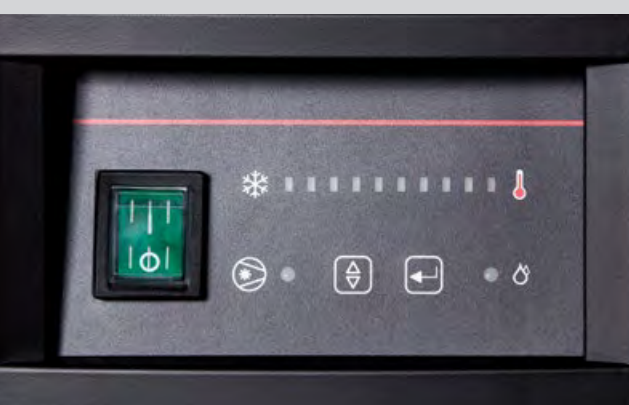
Controls: Models 200-1200 scfm