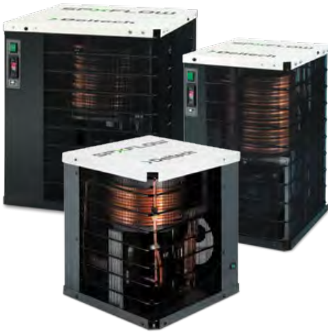
Efficient Smooth Copper Heat Exchangers

Customers around the world have relied on Deltech for great value in air treatment solutions. Deltech Value Line Refrigerated Dryers offer a simple solution based on a long history of industry leading technology.